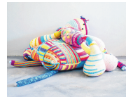
UNTITLED (GO AWAY-#3) (2015) By Lau Yiling, digital print, 59.4x84.1cm

Responding to an image of overcrowded swimming pools in China due to global warming, Tong reveals the joys and pain of summer from the perspective of a miniature human.