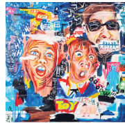
OUR WORLDUST ENJOY THE MOMENT (2015) By Naufal Abshar, acrylic and soft pastels on canvas, 91x61cm

Drawing inspiration from the cup, a most basic form of receptacle, Loke merges the mouths of two cups to make one vessel. This work reflects on the idea of friendship and its potential overlap with desire.