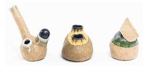
UNTITLED (CERAMIC VESSELS) (2015) By Kathryn Loke, ceramics, various dimensions

Multidisciplinary artist Loi creates a poetic visual using the interaction of water and ink – the work reflects the unlimited possibilities of life.